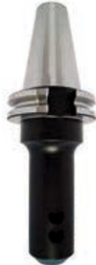
Tapered Style* (denoted with "T" at end of part number)